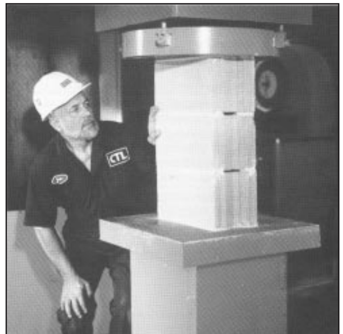
In-place performance of masonry can better be evaluated from results of masonry assembly tests than from test results of component masonry materials.

In addition to the related variables noted in Table 1, test results are affected by inherent variations in the procedures and the technique used by the person performing those procedures. Clearly, methods that have fewer contributing variables are generally more desirable for quality control testing. Test methods that are affected by a complex combination of factors (such as compressive strength)