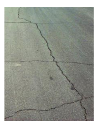
Base Failure Cracking