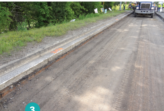
Milling the pavement to lower it two inches below the original gutter elevation