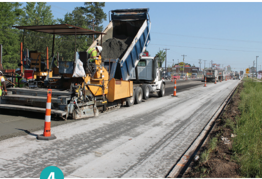
4 RCC is delivered to high-density paver while traffic uses the RCC pavement in the adjacent lane placed 48 hours earlier