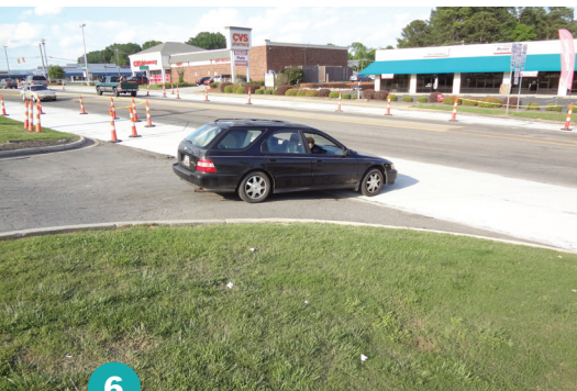
6 During the curing period, mainline traffic is kept off the RCC pavement, but crossing traffic is allowed at driveways