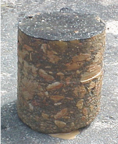
Pavement core proves strength of CTB. Even in severe climates the strength of CTB increases due to continued cement hydration.

Cores taken from soil-cement pavements furnish proof of its strength. Samples taken after 15 to 20 years show considerably greater strength than samples taken when the pavement was initially built. Because the cement in soil-cement continues to hydrate for many years, soil-cement has “reserve” strength and actually grows stronger.