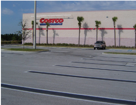
Soil-cement parking lots offer low initial cost and fast construction

The use of soil-cement can be of great benefit to both owners and users of commercial facilities. Its cost compares favorably with that of granular-base pavement. When built for equal load-carrying capacity, soil-cement is almost always less expensive than other low-cost site treatment or pavement methods. The use or reuse of in-place or nearby borrow materials eliminates the need for hauling of expensive, granular-base materials; thus both energy and materials are conserved.