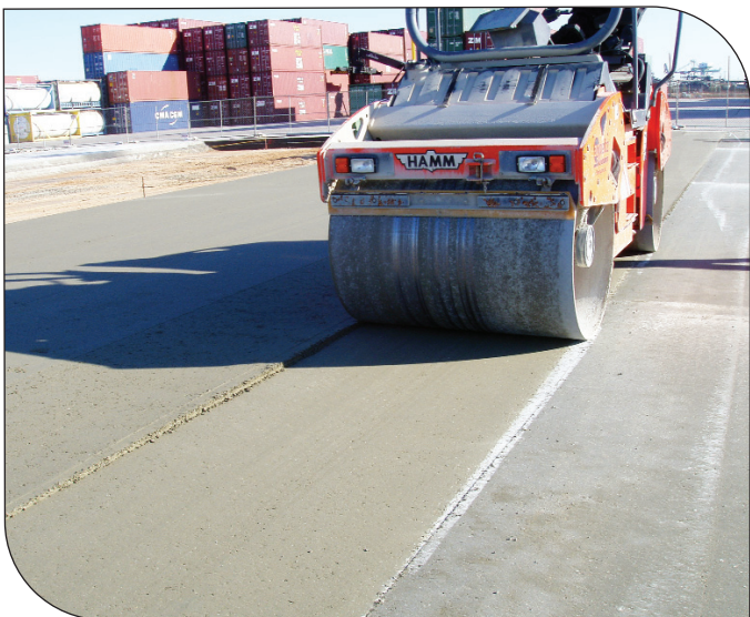
Figure 3—Compaction using vibratory roller and background showing containers stacked on RCC pavement completed earlier

CEMEX provided the cement for the project, while Vulcan Materials Company provided both coarse and fine aggregates. A.G. Peltz mixed all materials on-site utilizing an ARAN Modumix II continuous mixing plant with a capacity of 1000 tons per hour. A second ARAN ASR280B