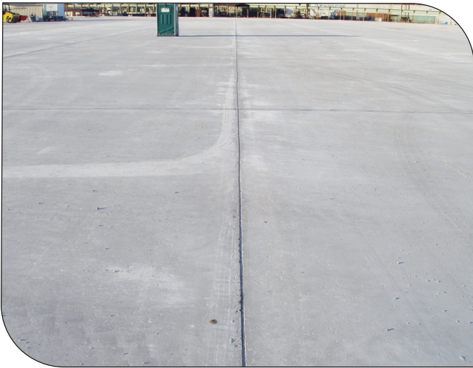
Figure 5—RCC transverse and longitudinal saw-cut joints at Choctaw Point, Mobile, AL

were impressed and stated this was the best RCC project they have examined. The quality was due to the care with which A.G. Peltz selected the RCC mix material and the workmanship of their employees.