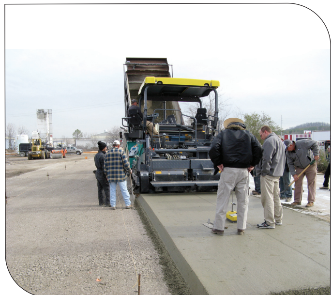
Figure 2—RCC Test Section

A.G. Peltz Group, LLC, the largest RCC paving contractor in the United States, was subcontracted by RB Baker as the primary paving contractor on the site. The RCC specification for this facility required a 790 psi flexural strength after 28-days and a correlation was established