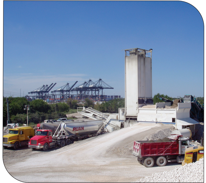
Figure 4—ARAN Modumix II Continuous Mixing Plant

pugmill with a capacity of 400 tons per hour was the backup plant to ensure that the paving operation remained continuous. A variety of rollers were used on-site, including pneumatic rubber coated and tandem rollers.