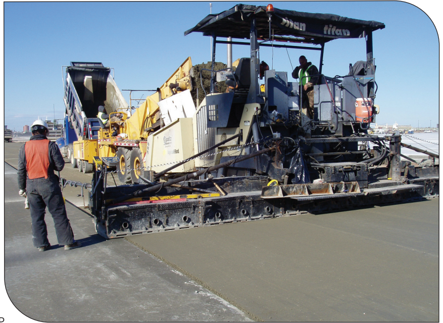
Figure 1—RCC paving at Choctaw Point Terminal in Mobile, Alabama

With more than 90 acres of the terminal utilized to transfer goods, both local and regional PCA representatives actively