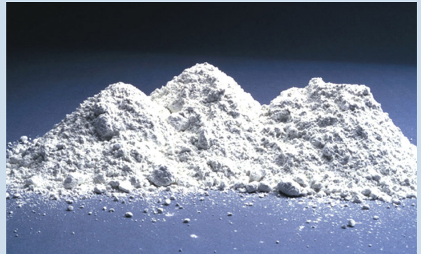
Figure 2. White cement provides a neutral base for mortars whether they are white or tinted. The sand can have a tinting effect on mortar, so it should also be carefully selected for color.

White mortar, just like gray and colored mortars, should meet the requirements of ASTM C270 for the type designated (N, S, or M). Sand should meet the requirements of ASTM C144 and be free of silt or clay fines. Buff or brown sands used to produce white mortar will impart a darker undertone to mortar color. This effect may become more pronounced over time, or with cleaning, as sand particles are exposed due to erosion of the white mortar paste. To assure whitest mortar color, use only white sand.