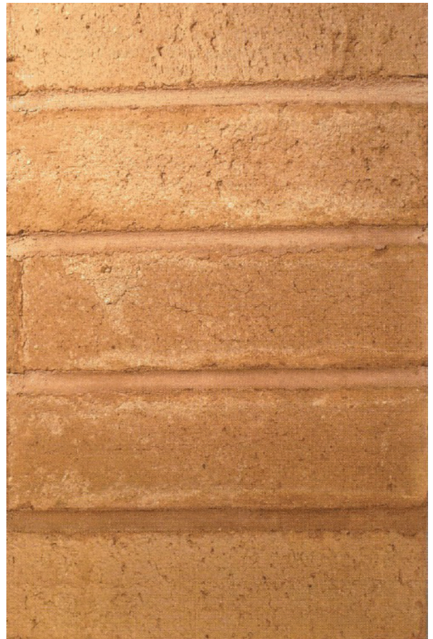
Figure 4. Made with one batch of mortar, these joints show the effect of mortar consistency and tooling time on mortar color. The top mortar joint was tooled immediately after placement of the unit. Remaining mortar joints were tooled at progressively greater time intervals and thus stiffer consistency, resulting in darker colors.

Mechanical mixing of mortar is recommended. Pre-blended mortars should be mixed according to the manufacturer's recommendations. For other mortars, use instructions provided by the mortar supplier. If no mixing instructions are given, experience has shown that good results can be obtained when about 3/4 of the required water, 1/2 the sand, and all the pigments and cementitious materials are briefly mixed together. The balance of the sand and the remaining water are then added to bring the mortar to optimum working consistency. The amount of water added should be the maximum that is consistent with satisfactory workability. After all the mortar materials are combined together, they should be mixed for 3 to 5 minutes. It is advisable to mix the full 5 minutes when producing pigmented mortars.