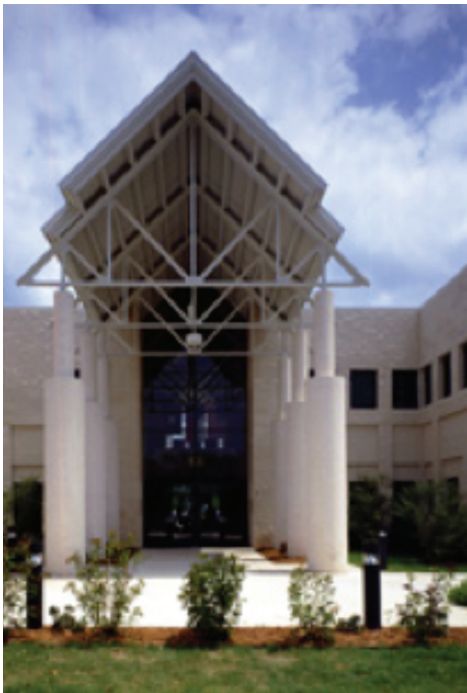
Figure 1. Visually, mortar can represent a significant portion of a masonry façade. Where a white masonry wall finish is desired, white units should be assembled with white mortars.

Masonry is a versatile medium for architectural expression. Fluted, split-faced, ground-faced, and custom prefaced architectural concrete masonry units are available in a myriad of textures and colors. Fired clay masonry units are manufactured in numerous color and texture options. White or colored mortars can provide a color contrast or harmony between masonry units and joints. Combining finishes and colors allows a limitless range of visual statements the designer can make with masonry.